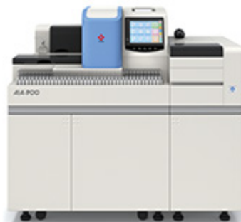
AIA ® -900