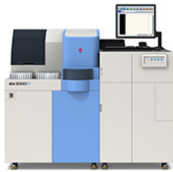
AIA ® -2000

Endocrine 68, 251-252 https://doi.org/10.1007/s12020-020-02325-1