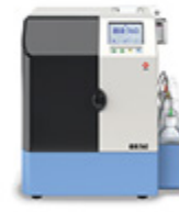
AIA ® -360