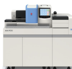
AIA-900 with 9 Tray Sorter (Also available in 19 tray sorter option)