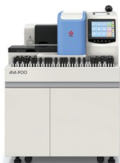
AIA-900 Loader Model