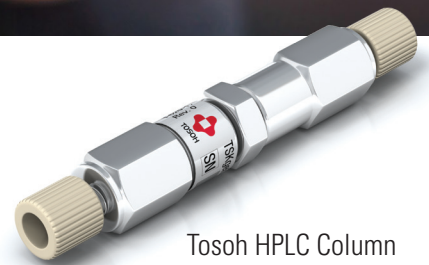
Tosoh HPLC Column